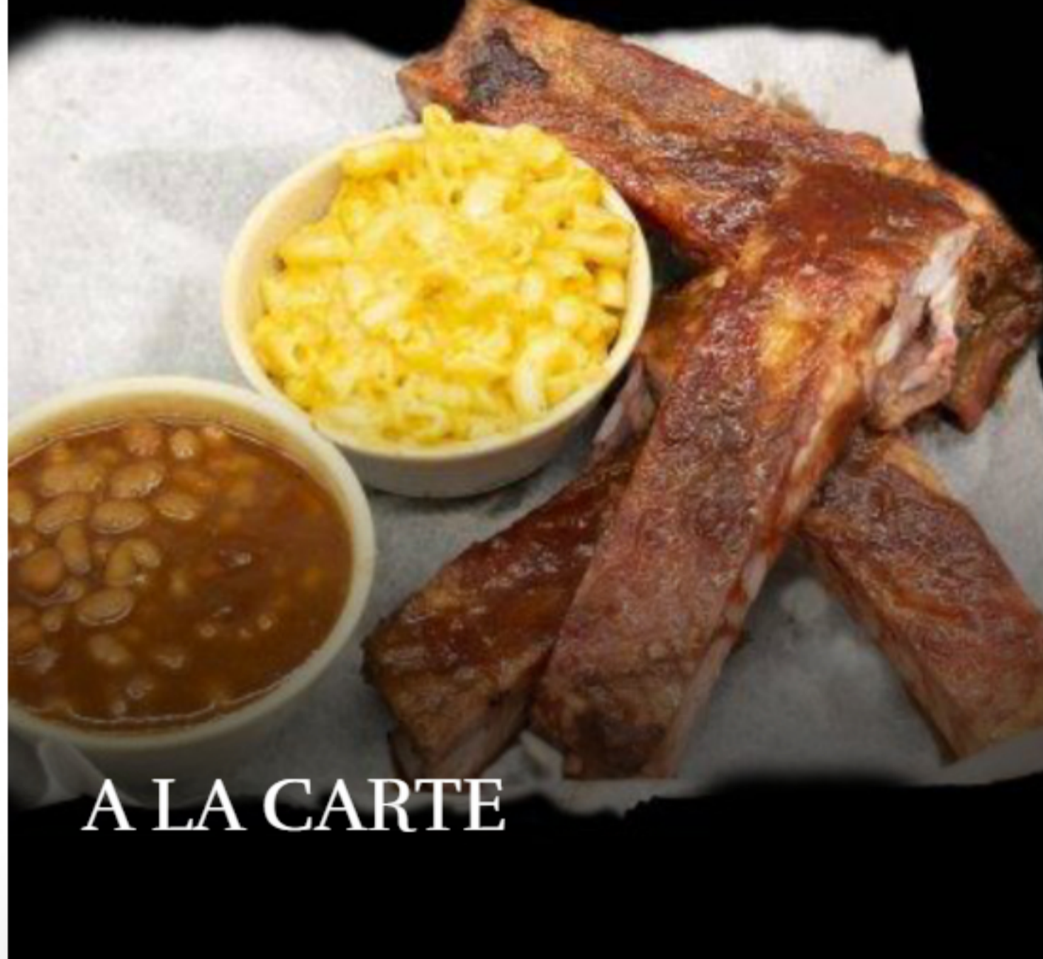
A LA CARTE